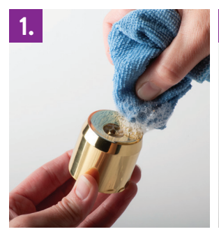
Clean brass burners and followers with warm water and dish soap.

Brass burners used with Refillable Candles and the decorative brass followers that can be used with Shell Candles are coated with a protective layer of clear lacquer. These parts can be cleaned with warm water and dish soap. A small amount of wax polish can also be used to help protect the lacquer finish. The use of brass polish is not recommended with these parts as this could damage the lacquer finish.