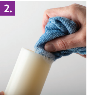
Wash the nylon part of your candle with warm water and dish soap.

Brass burners used with Refillable Candles and the decorative brass followers that can be used with Shell Candles are coated with a protective layer of clear lacquer. These parts can be cleaned with warm water and dish soap. A small amount of wax polish can also be used to help protect the lacquer finish. The use of brass polish is not recommended with these parts as this could damage the lacquer finish.