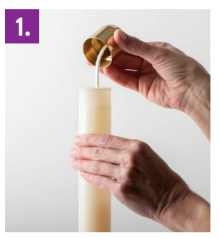
Remove brass burner and empty any remaining Liquid Paraffin.

To keep your Lux Mundi candles clean, simply wash the nylon part of your candle with warm water and dish soap. Household cleaners like Fantastik or 409 may also be used if a more thorough cleaning is required. Be sure to remove the brass burner and empty any remaining Liquid Paraffin before cleaning Refillable Candles. Carefully clean around the metal or decal ornaments on Paschal Candles or Christ Candles so that you don't damage the finish on these elements.